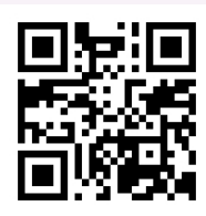
Scan The Cornerstone QR code with your iPhone or Android

As times grow more challenging, some are finding it harder and harder to walk out their faith. Pray that we do not become faint in well-doing. Ask God to shower grace on the saints to stand together as a people, firm in our faith, and unshaken by circumstances.